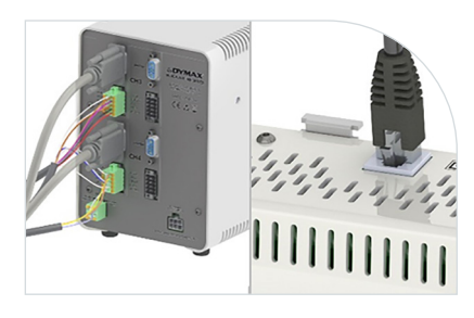
From this wiring