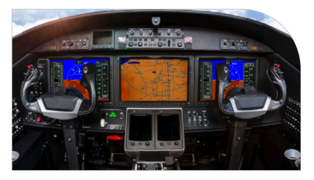
Optical bonding increases clarity, viewing angle, and vibration resistance

The "on-demand cure" of these adhesives allows substrates to be repositioned precisely until parts are ready to be cured. Using a thin layer of Dymax adhesive controls cost and can reduce the weight of the final product. The adhesive also acts as a barrier against stress, significantly improving product reliability and warranty costs. Dymax display adhesives come in a variety of viscosities for ease of use and controlled dispensing and are available in a wide range of packaging sizes.