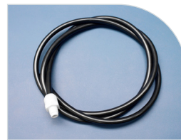
PE Fluid Line Kit