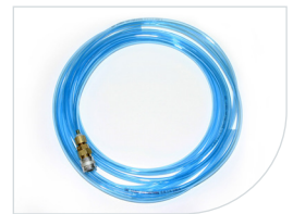
Reservoir Air Line Kit